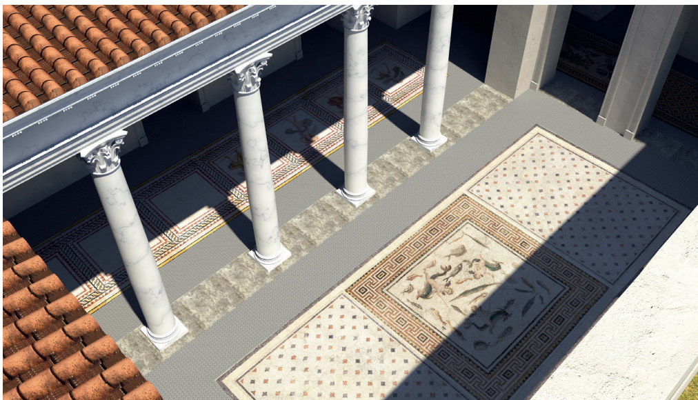
Figure 5: Digital model of House of the Drinking Contest.