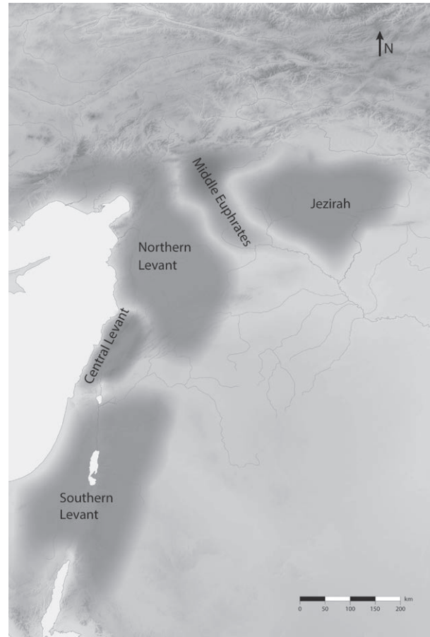
Figure 1.1. Map of regions included in the present study (map by C. Forster - Datalino, Berlin; graphic elaboration by V. Tumolo).

Although such classification into geographical units mirrors Early Bronze Age cultural nuclei , these