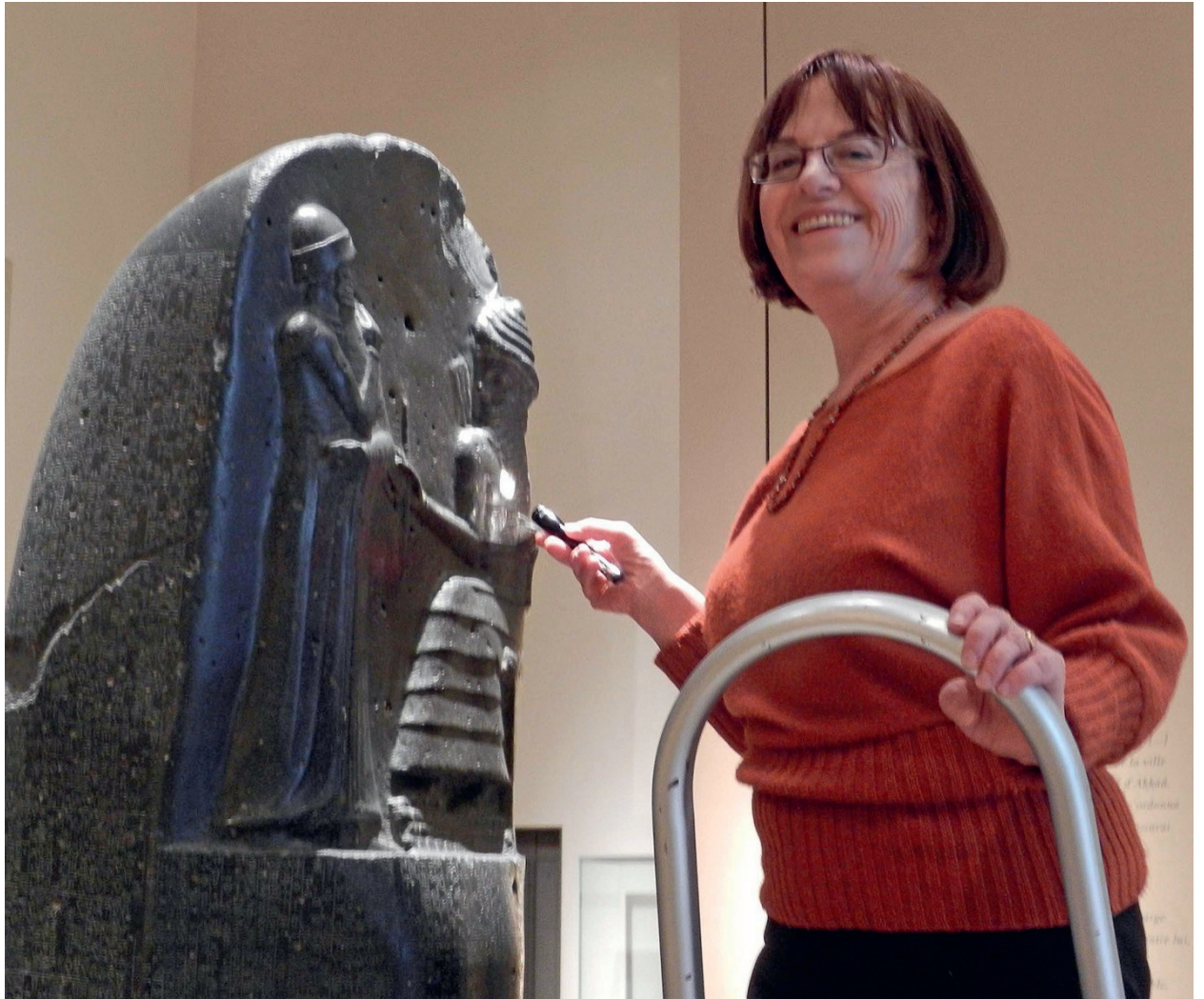
2013. Eye to eye with Hammurabi at the Louvre.