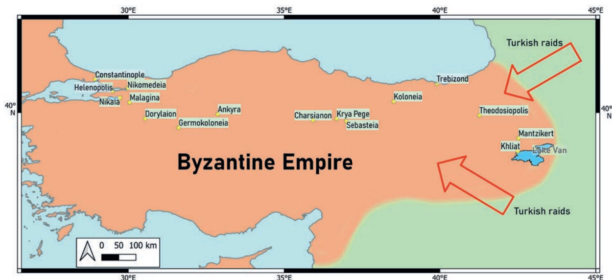
Figure 1: Byzantine Anatolia at the time of the Turkish raids.

Basil II (976-1025) left Byzantium with an expanded empire, a strong successful army and a healthy treasury when he died, childless, leaving his brother Constantine VIII as head of the Empire. From the 1040s in particular, Byzantine military strength had been jeopardised by civil wars, rebellions and a preponderance of bureaucratic emperors who favoured the metropolitan elites above the provincial military aristocracy. 9 Basil II's successes ensured that the Bulgars in the west no longer presented a threat, and in the east the aggression from Muslim lands was limited. Due to a series of military revolts in the 11th century, driven by the anti-military policies of the emperors, the thematic levies, citizen soldiers recruited from the Empire's own provinces, had been unused and in some cases disbanded in favour of regionally recruited field armies, known as tagmata, whereas the existing field armies had been partially replaced by foreign mercenaries. 10 Nevertheless, there is evidence to suggest that properly led Byzantine armies had some measure of success up to the 1060s. 11